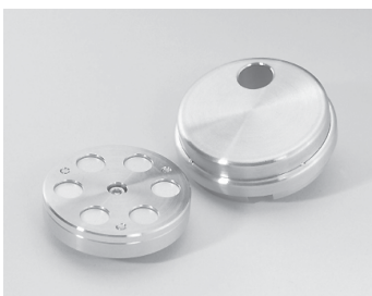
Crystal retainer assembly and standard stainless steel cover