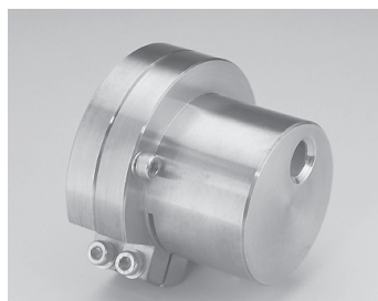
Copper Head Cover